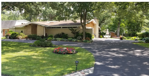
Third Place: The Mavrogeanes Family 20717 Thornwood Drive

Congratulations to all of the winners and nominees! View the full list of nominees on the Village's website, under Beautification Committee.