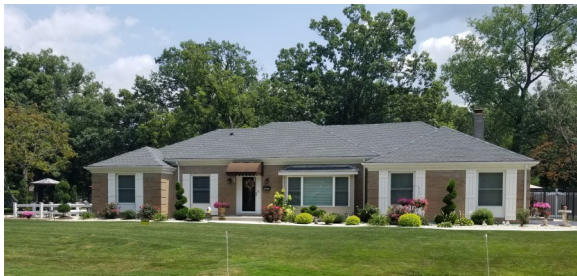
Second Place: The Young Family 20801 Thornwood Drive