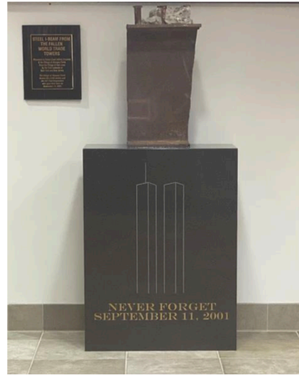
Photo: Steel I-Beam From the Fallen World Trade Towers